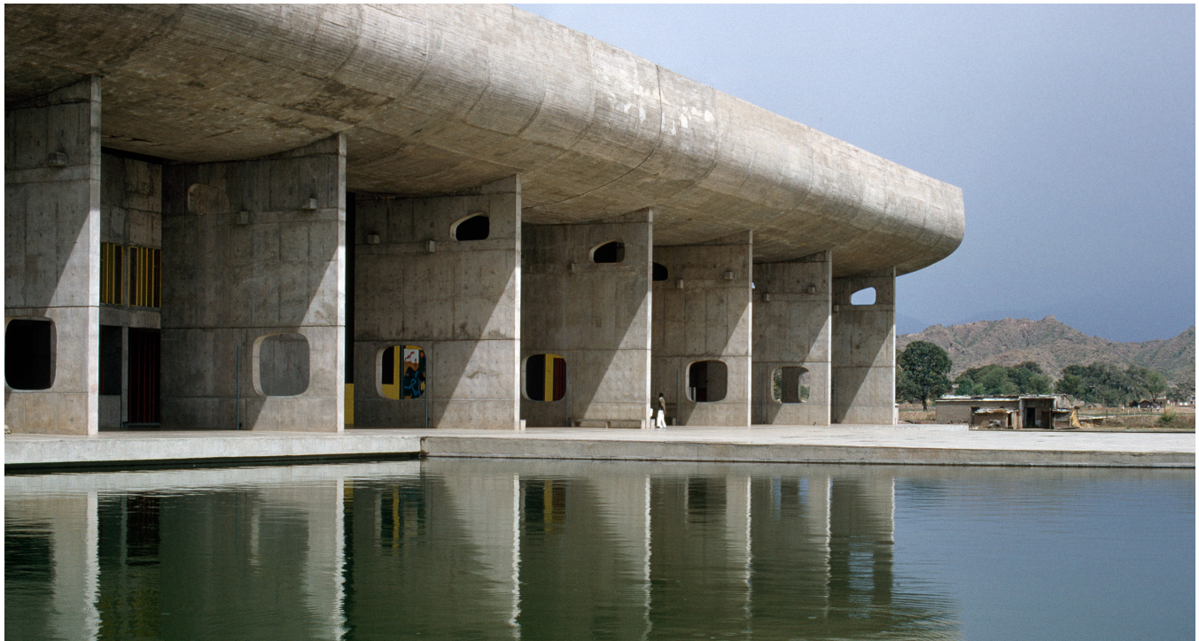
Palace of Assembly exterior; portico, basin ca. 1965.