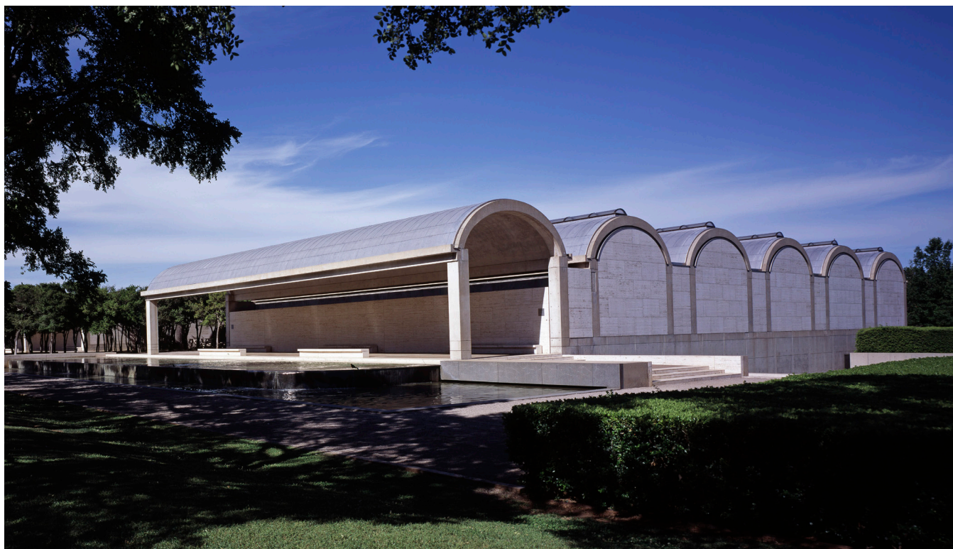
South Wing of the Kimbell Art Museum, Fort Worth, Texas, 2011