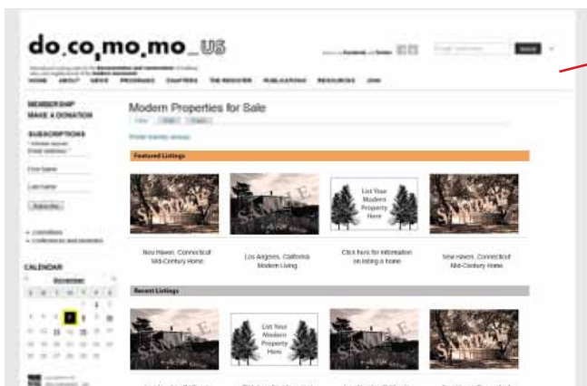
Modern Properties for Sale - Front Page