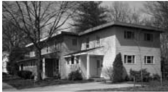
Typical duplex, Greenhills, OH

T he village of Greenhills, Ohio, conceived during the Depression as one of twenty proposed housing initiatives under the auspices of Franklin Roosevelt's Resettlement Administration, remains one of only three such developments built. While building these "greenbelt" communities was intended mainly to create jobs as well as middle- and low-income housing, the New Deal progressive planners and social housing advocates also incorporated modern town planning and architectural design inspired by the Garden City movement, pursuing a socialist agenda that included open space and community amenities.