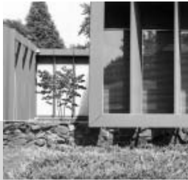
Behlen House, Columbus, NE, 1958. Detail: corrugated 16-in steel panels