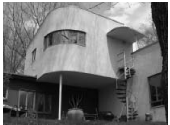
Detail, Field House, New Hartford, CT