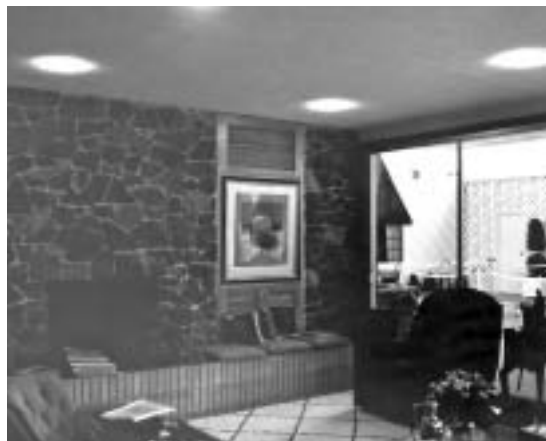
Family room with natatorium visible through glass doors at right