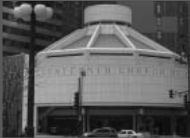
Seventeenth Church of Christ, Scientist, Chicago, IL, 1968