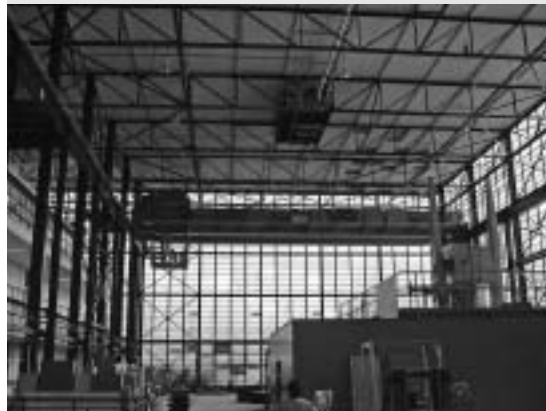
Gunner's Mates School, Great Lakes Naval Station, IL