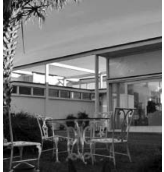
Front perspective with detail of clerestory windows.

Originally a four bedroom multi-level structure, the 2,900-square foot Kerr House is a composition of orthogonal elements organized around a central double-height living area. Flanking split-level wings accommodate other functions, with the whole complex possessing the spatial efficiency of a trailer home, one of the South's most mundane icons (and a 'building typology' Rudolph loved to