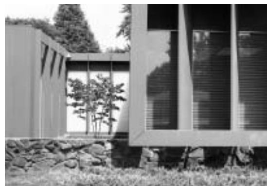
Detail: corrugated 16-in steel panels

Structurally, the Behlen house was overbuilt, almost as if it had been constructed for industrial purposes—or an engineer's dream. The house utilizes over sixteen miles of single-conductor wire and three-phase 220 circuits, the same as was used on the battleship Missouri . The house was built on a concrete slab, with only 1/4" inch variance from end to end. Fluorescent lights were used throughout the