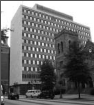
615 Peachtree Street, Atlanta, GA, 1959

Preparation for demolition of the 615 Peachtree Street building began in April 2006 to make way for a new condominium development. As of May 1, the developer's plans for the site have not been officially announced.