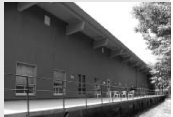
Hostess House, Great Lakes Naval Station, IL

The Great Lakes Naval Station project in Great Lakes, Illinois, was the first military project of Skidmore, Owings, and Merrill (SOM). The Hostess House (Building 42) was designed by Gordon Bunshaft and completed around 1942. It remains the only extant building designed by Bunshaft from the pre-war years. This building is an exceptional testament to the development of both the firm and modern American architecture. The rectangular building sits on a long narrow site, encompassing diverse programs including a reading and writing room, reception room, lounge, terrace, and offices. The roof consists of a series of laminated wood frames, which are supported at both ends by steel columns. The exposed wood trusses project through both façades, uniting inside and outside, creating a dynamic atmosphere.