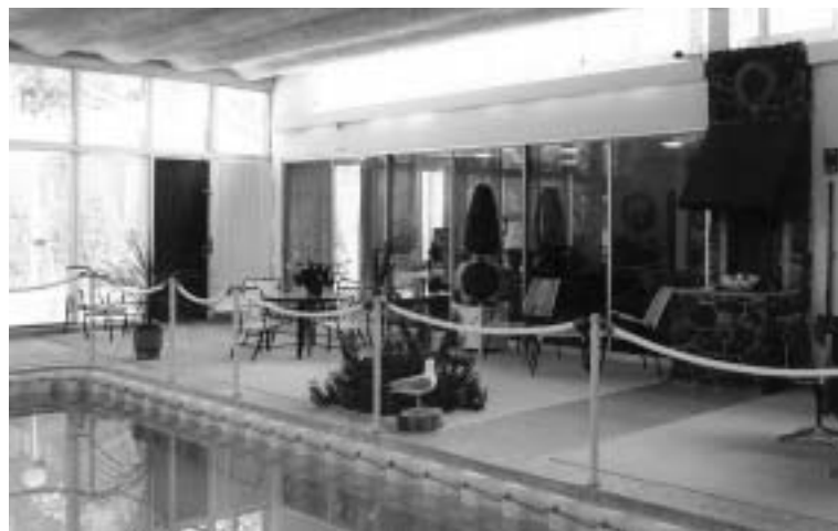
Natatorium, with steel paneled ceiling

Editor's Note: Control of the home was recently returned to the Behlen family after the state Attorney General ruled that the title had not been properly transferred from the family to the Nebraska State Historical Society (NSHS). Furthermore, Nebraska state officials declined to approve acceptance of the home for use as a state-operated historic site, despite its listing on