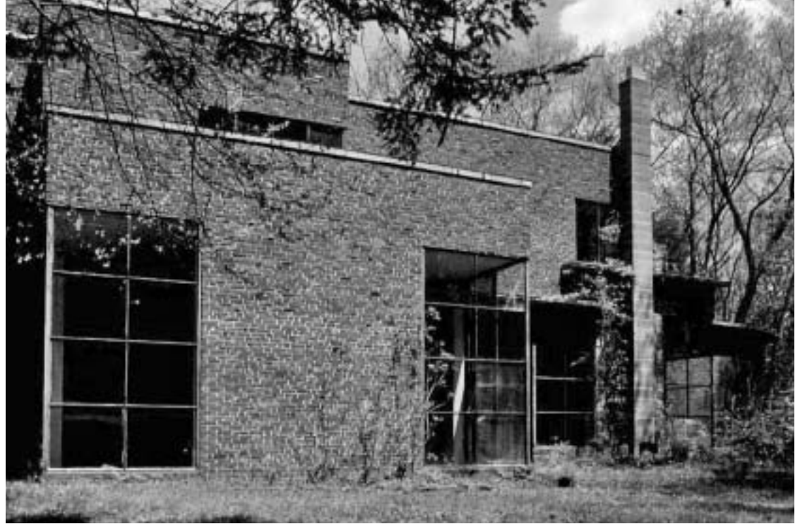
Rear façade, Wells House, Southbridge, MA, 1933