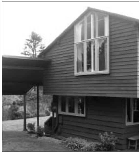
Exterior, Joss House, Portland, OR (photo: Andrew Phillips)

For Oregon's preservationists, the sellout success of the recent Street of Eames tour in April, 2006, is a hopeful sign for the survival of mid-century modern houses. 600 people joined the tour and its affiliated events, demonstrating the growing appreciation for this important architectural legacy. The visit to six houses provided a unique opportunity to see quintessential examples of many modern styles and to follow their evolution from 1942 until today. Several were in the Northwest Style, a regional reaction to European modernism that emphasized detailed wood structures and connections to the area's unique light and landscapes.