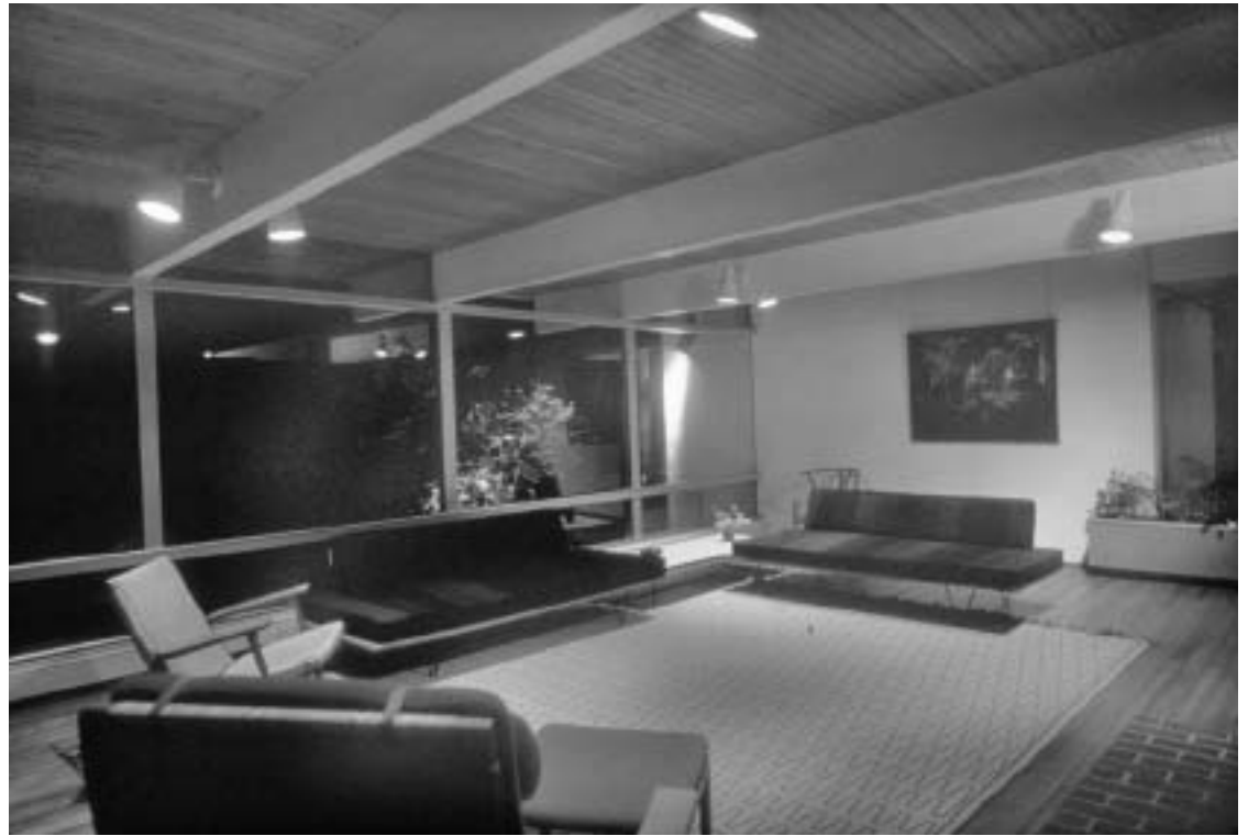
Interior, Kuhn House, Princeton, NJ, 1960-61

If you would like more information about how to prepare a fiche, get a copy of the NY/Tri-State "Wish List," or to sign up to document a particular building contact, the Register Committee Chair via nytri@docomomo-us.org .