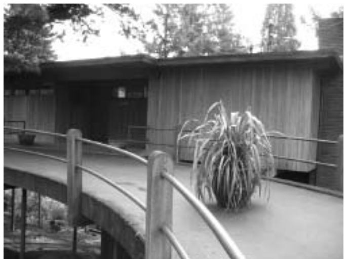
Dixon House, Portland, OR