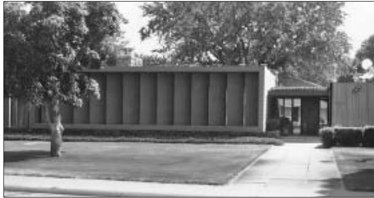
Behlen House, Columbus, NE, 1958