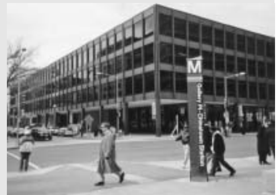
Martin Luther King, Jr. Memorial Library, Washington, D.C.

The 420,000 s.f. black metal and bronze-tinted glass building was designed by famed modern architect Ludwig Mies van der Rohe to be capable of serving, with the addition of a fifth story, as the city's central library for 150 years.