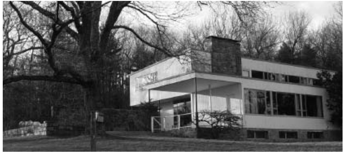
Jackson House, Dover, MA, 1940-41

Such syntheses are to be found throughout the house: plywood walls have a walnut stain and the massive, open plan living-dining area is combined with a full basement below and tautly closed bedrooms above. The lintels of the fireplaces—which are all situated in a massive field-