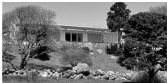
Cerrito Residence from the street, Watch Hill, RI

From the road, the Cerrito Residence appears as a long single-story volume at the top of a slope, its broad face oriented south looking towards the expansive views of the ocean. The driveway reaches the top of the slope and encounters the opposite side of the house where the rectangular volume rests on a stone base. This lower portion contains the garage and other services; an exterior stair gives access to the living areas above. On the south side the stone base appears as short transversal walls supporting the main