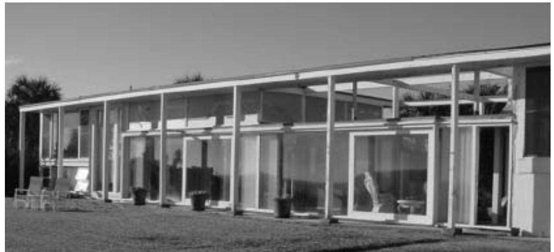
Rear façade, Kerr House, Melbourne Beach, FL, 1951

explore). It does not possess the Sarasota houses' overtly expressive elements. Instead, experimenting with regional typologies, building/site relationships, the environment, and indigenous materials, the architects took the more subtle approach of setting the building into its site, a 150-foot expanse of sea grapes and sand dunes, while strengthening the overall massing. Physically and intellectually, the architects embraced their site by framing views that dissolve the boundary between inside and out, thereby orienting inhabitants so they are always connected with the ocean. As in their other houses, the Kerr was built to breathe, using a modularized grid of solid cypress posts and beams and infill of Ocala lime-block, giant sliding glass doors, and wood jalousie walls to provide the perfect natural