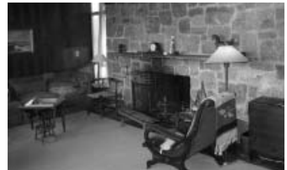
Detail: Fieldstone wall and fireplace with distinctive lintel.

stone wall at the core of the house—offer the most dramatic example. At the edges, the lintel stones are laid flush at either side without resting on the stones below in a modernizing, atectonic gesture. Nonetheless, all of the lintels feature centrally-placed keystones.