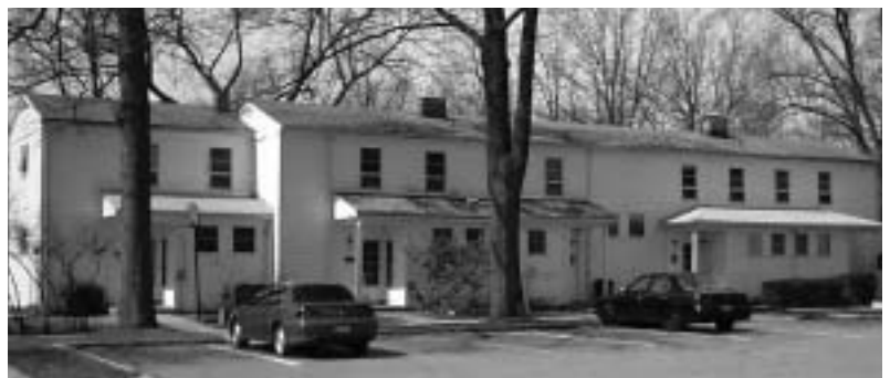
Rowhouses in Greenhills, OH

The Greenhills Historical Society has, with the backing of the Cincinnati Preservation Association and the National New Deal Preservation Association, requested a moratorium on demolition in the village, and asked for an open planning process to guide future development. However, some townspeople welcome the redevelopment,