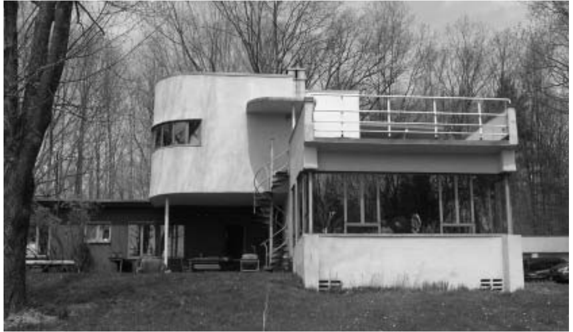
Field House, New Hartford, CT